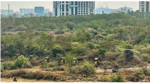
Nature's loss: Excavators used by the State government seen in the 400-acre land in Kancharla Gachibowli, in Hyderabad last month.

Forest Survey report Mr. Singhvi maintained that "thousands" of trees were not cut. "We have seen the photographs,"