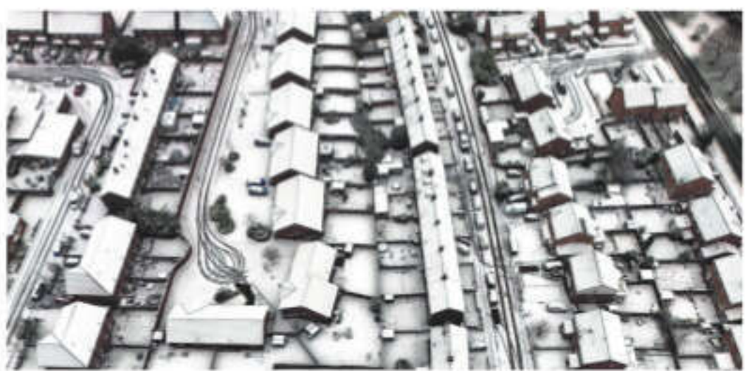
Snow blankets Lee Park in Liverpool, England, on Sunday

The National Grid, which oversees the country's electricity network, said it had been