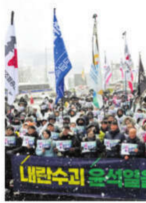
Protesters in Seoul demanding for the arrest of its impeached president