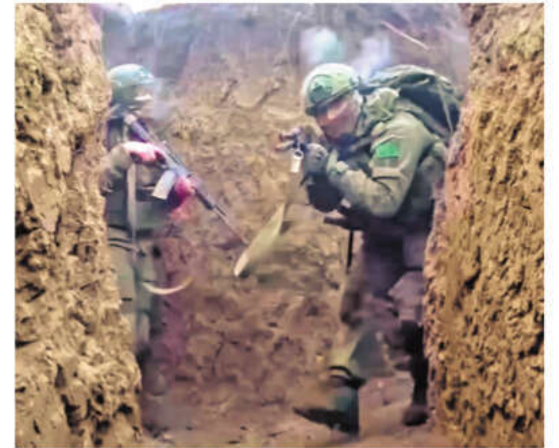
In this videgrab, Russian servicemen attend a combat training

Frankfurt airport canceled 120 of its 1,090 planned takeoffs and landings on Sunday. At Munich airport, only one runway was open while the other one was being cleared. AP