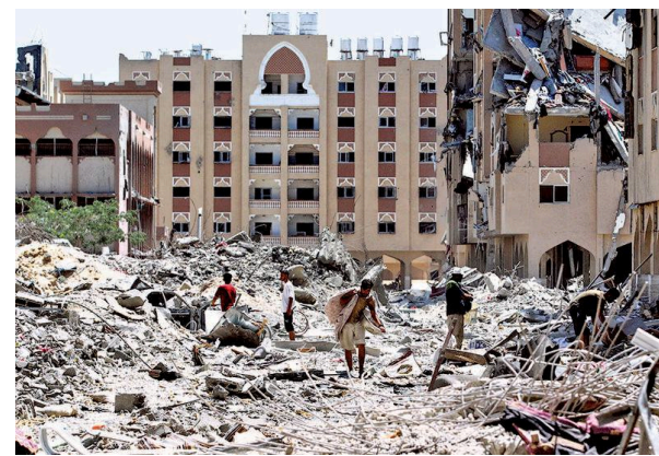
War toll: Palestinians inspect damage in the Qatari-funded Hamad City, following an Israeli raid in Gaza on Saturday.

The Israeli military said it was looking into the reports.