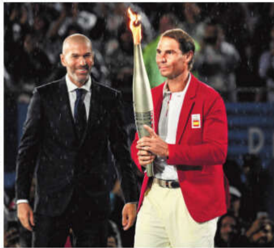
(Clockwise) Teddy Riner & Marie-Jose Perec watch as the cauldron rises in a balloon. Football legend Zinedine Zidane (L) with Spain's Rafael Nadal (R), who carries the Olympic flame. Canadian singer Celine Dion performs at the Eiffel Tower. An overview of the Trocadero venue

Naomi Osaka (Tokyo Games), figure skater Yuna Kim (Pyeongchang Games), marathon runner Vanderlei Cordeiro de Lima (Rio de Janeiro Games), ice hockey player Vladislav Tretiak (Sochi Games), a group of seven teenagers chosen