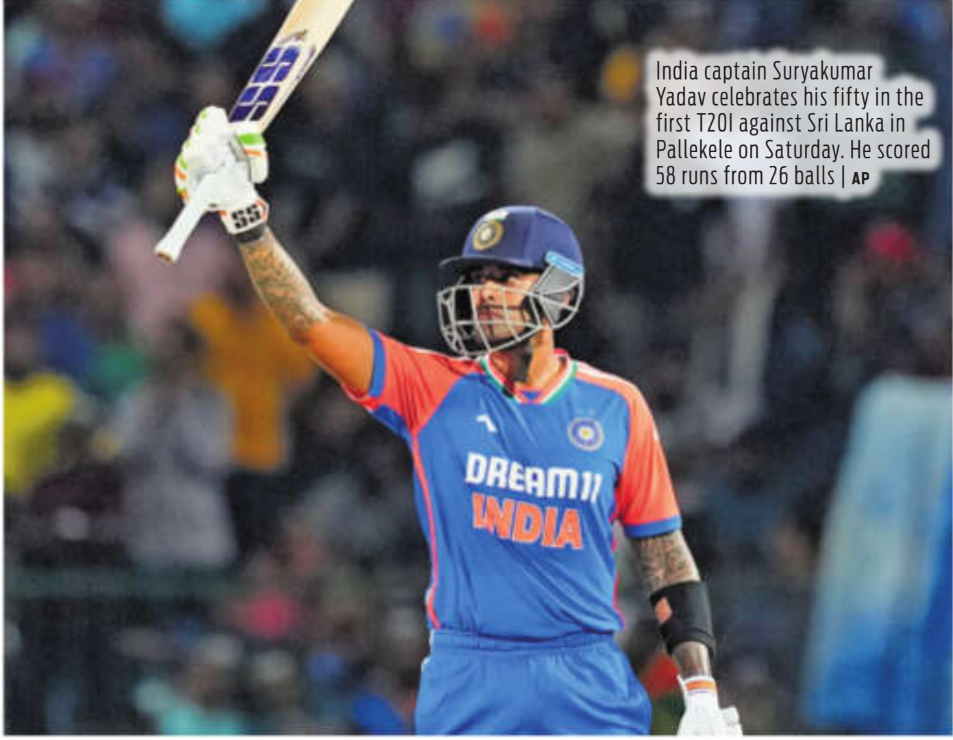
India captain Suryakumar Yadav celebrates his fifty in the first T20I against Sri Lanka in Pallekele on Saturday. He scored 58 runs from 26 balls

by veteran British Olympians (London Games) and ice hockey great Wayne Gretzky alongside basketball player Steve Nash (Vancouver Games). The cauldron was a ring of flames 7 metres (about 23 feet) in diameter, topped by a 30-metre high (about 100 feet) and 22-metre wide (about 72 feet) hot-air balloon. The design was a tribute to the first flight in a hydrogen-filled gas balloon, made by two French inventors in 1783 from the Tuileries Garden. AP