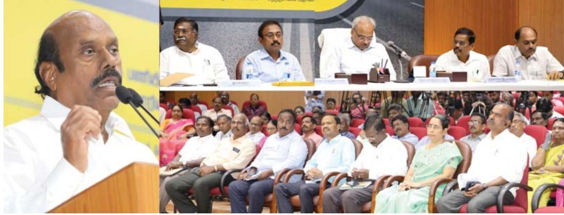
MINISTER FOR PUBLIC WORKS INAUGURATED THE INDUCTION TRAINING PROGRAMME FOR THE NEWLY RECRUITED ASSISTANT ENGINEERS AND TO THOSE PROMOTED AS JUNIOR ENGINEERS IN HIGHWAYS.

Criticizing the ruling DMK government, the opposition leader stated that it was disheartening to see the state's ration shops, which had once set historical records in public distribution and served as a model for the nation, facing such a situation now. "I strongly condemn the DMK government for causing this crisis in ration shops, leading to a shortage of essential items," he said. Palaniswami then urged Chief Minister MK Stalin to ensure that all essential items are distributed smoothly and without any shortages in the ration shops, which serve to fulfill basic needs of the poor and the underprivileged.