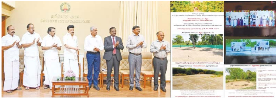
CHIEF MINISTER INAUGURATED THE EXCAVATION PROJECT OF TAMIL NADU ARCHAEOLOGY DEPARTMENT AT KEEZHADI AND SURROUNDING PLACES.