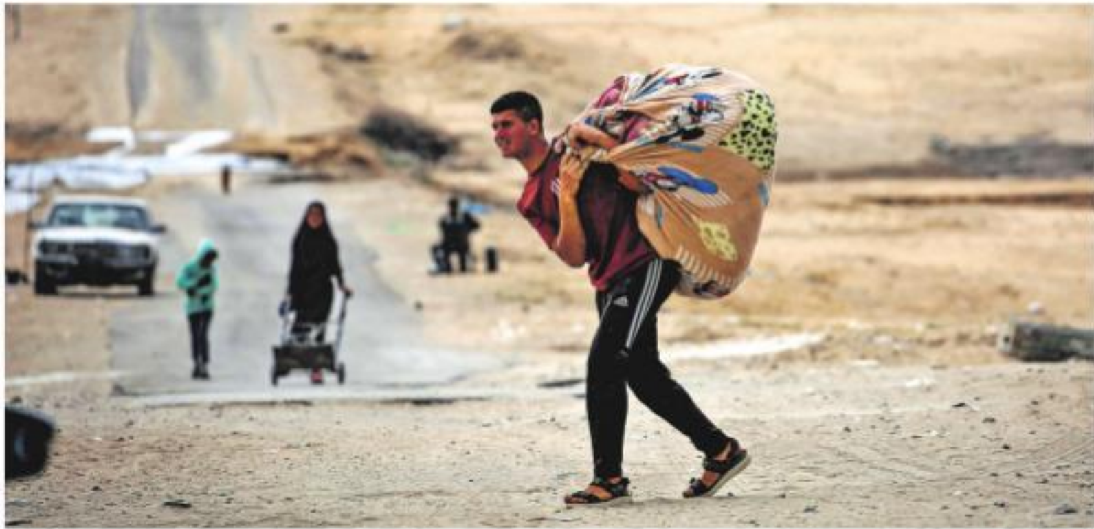
Palestinians carry their belongings as they flee Gaza Strip on May 13

Over 1,000 Hamas fighters taking treatment in Turkish hospitals, says President Erdogan