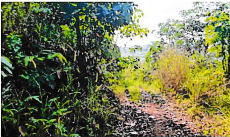
View at the entrance