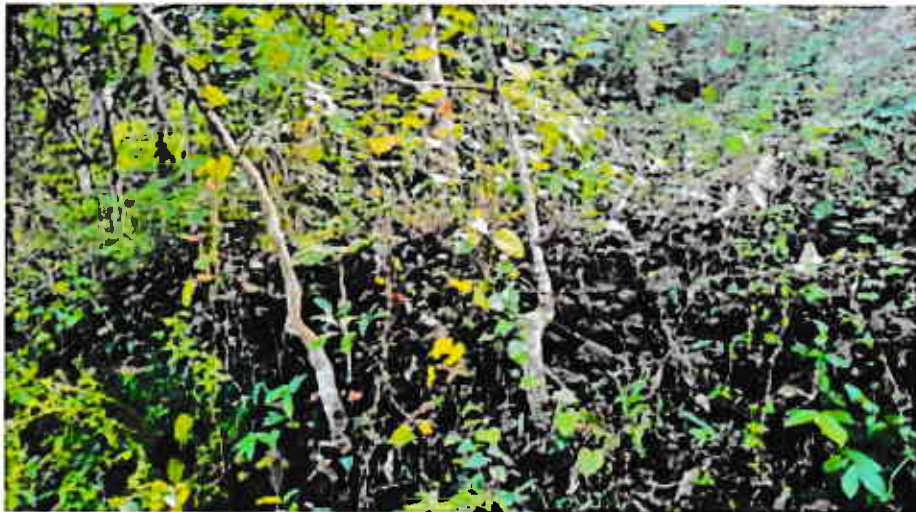
View at the end point