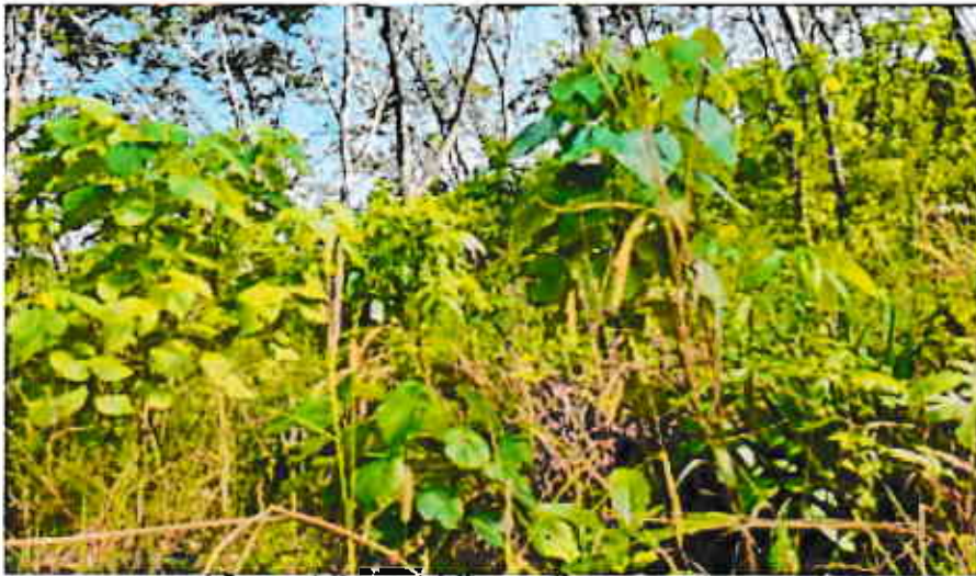
View at the middle portion