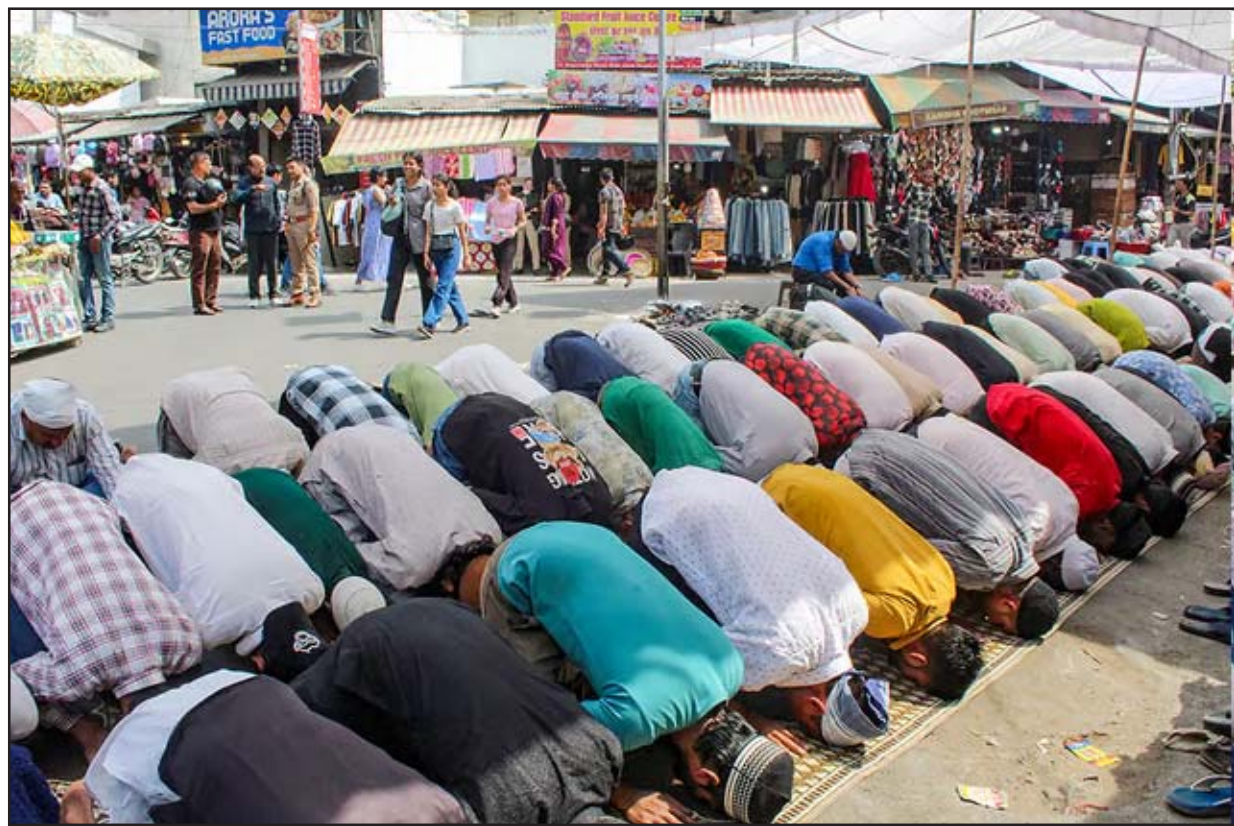
Muslims offer Friday prayers on a road during the fasting month of Ramzan at Jama Masjid Paltan Bazaar, in Dehradun.