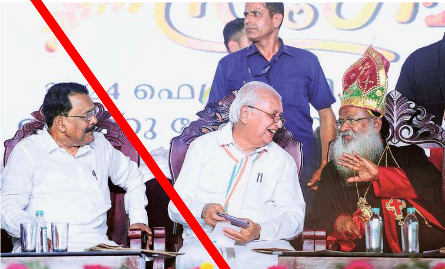
Seeking a solution: Baselios Marthoma Mathews III Catholicos, head of the Malankara Orthodox Syrian Church, interacts with Kerala Governor Arif Mohammed Khan and Goa Governor P.S. Sreedharan Pillai during the Marthoman Heritage Assembly in Kottayam on Sunday.

Stating that the Supreme Court verdict has settled the dispute on the ruling of parishes under the Malankara church by upholding the validity of the 1934 Constitution of the Malankara Church, the Catholicos emphasised that those attempting to deprive the Orthodox church of its freedom and