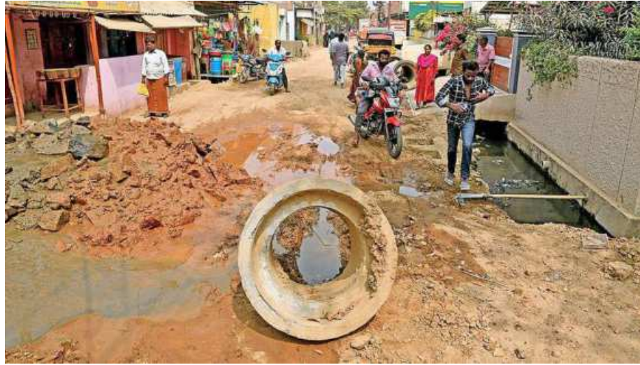
The Line Road between Linemedu and Shevapet Police Station in Salem has become a commuters' nightmare due to the long drawn-out underground drainage works.