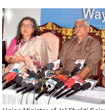
Union Minister of Jal Shakti Gajendra Singh Shekhawat and other dignitaries in Chennai on Tuesday.

The Cauvery Water Regulation Committee (CWRC) is an unbiased platform working towards best management of water resources, said Union Minister of Jal Shakti Gajendra Singh Shekhawat on Tuesday. He was speaking at a press conference after the All India Secretaries Conference on Water Vision @2047 Way Ahead, which was organised by the National Water Mission of the Ministry of Jal Shakti, and coordinated by the Tamil Nadu Water Resources Department here.