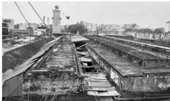
Traders in Grand Bazaar are protesting against the government's decision to temporarily shift them to AFT Ground to facilitate construction of a new market. S.S. KUMAR

Addressing a press conference along with traders of GB on Friday, AITUC general secretary K. Sethu Selvam said around 1,400 shops were functioning in the market.