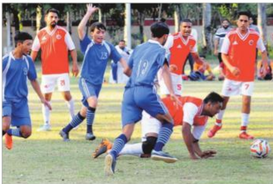
Players in action during the Senior State Football Championship at the Police Lines, Sector 26, Chandigarh.